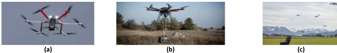
Figure 2. Components of the Drone Fleet (DF) in the CURSOR project: (a) Mothership Drone (MD); (b) GPR Drone (GPRD) and Transport Drone (TD); (c) Modeling Swarm Drone (MSD).

The MD system employs a 30x optical HD zoom-camera with encrypted HD video transmission, floodlights, a megaphone system (125 dB) and a WiFi access point. The GPRD system is a GAIA160 drone with the GPR sensor hanging from a cable on a remotely controlled winch. The GPR is able to detect survivors buried under several meter of debris by differentiating between slight movement, strong movement and breathing. The GPRD also employs radiometric Flir 640 and RGB HD cameras and floodlights. In TD mode, the GAIA160 drone is equipped with HD video camera, thermal camera, as well as floodlights and a megaphone. The TD is able to carry a special container for unloading SMURFs at selected sites to identify victims buried under rubble. The MSD system is comprised of altogether five DJI Mavic Pro (MP) drones operating as a swarm, with three intelligent flight modes are incorporated: (a) Obstacle Avoidance, (b) Active Track (objects), (c) TapFly (“point and fly” mode).