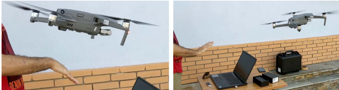
Figure 3. Pitching forward (left) and backward (right) with the DJI Mavic 2 using palm-based gestures.

commands. The UAV is controlled by a mobile device connected to the remote controller and running DJI's mobile SDK. Early test flights with both novice and experienced FR UAV pilots indicate that gestures provide easier and more intuitive control compared to the hand-held controller while allowing the same range of control and maneuvering.