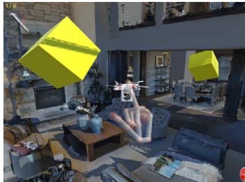
Figure 2. Controlling a UAV with finger-based gestures in a simulated environment.

FRs employ UAVs to assist them in several tasks while operating, including risk detection and victim localization. Typical UAV remote controllers tend to be heavy and cumbersome, require both hands to operate and have a significant learning curve. This is often contrary to the needs of FRs who may need to carry other important equipment and need to keep their hands free during a mission for other tasks. Considering the above, FASTER will introduce vision-based gesture control allowing FRs to fly UAVs in an intuitive and effective manner, without compromising their freedom of movement, safety, and ability to carry out their mission.